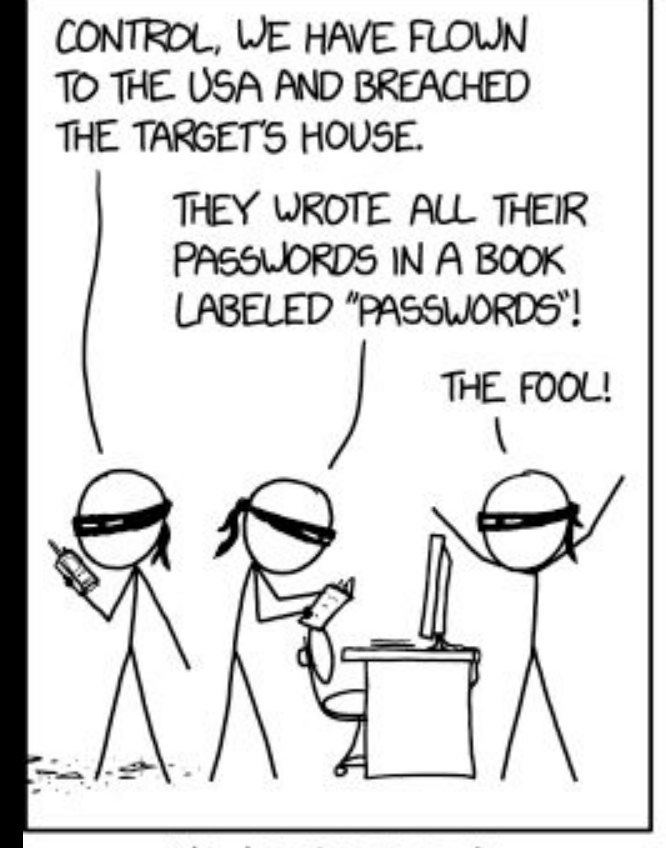
HOW PEOPLE THINK HACKING WORKS